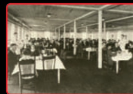
1917–18 Students have compulsory military training. Wartime coal shortage causes elimination of classes in the gymnasium to conserve fuel.