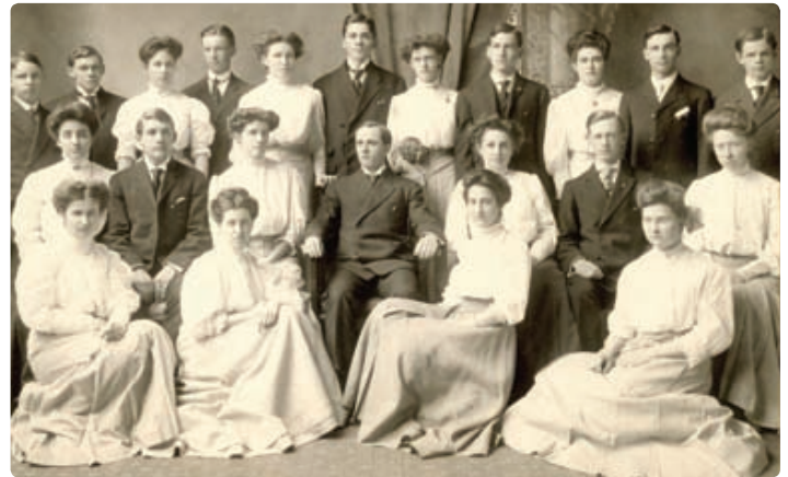
The Class of 1906