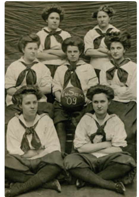
The 1909 girls' basketball team