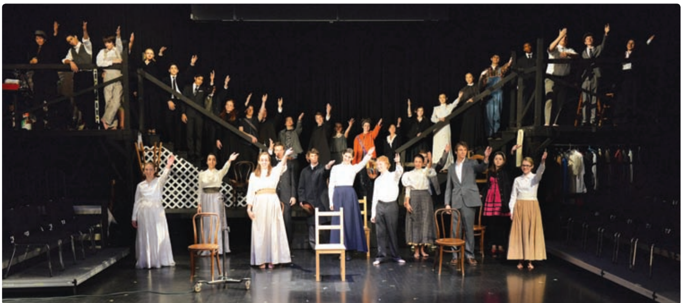
The cast of Our Town gathers onstage.