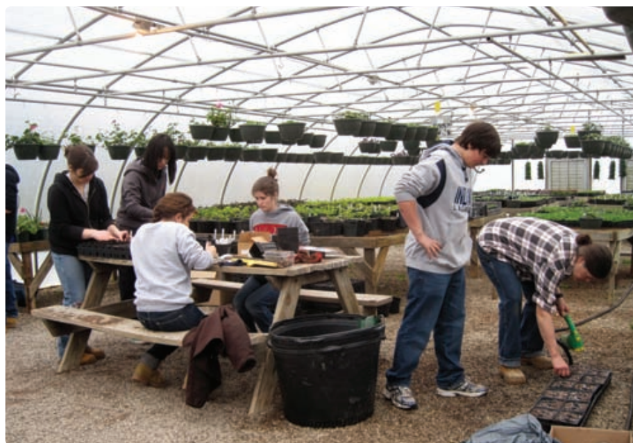
Students work on the farm at Henderson Settlement.