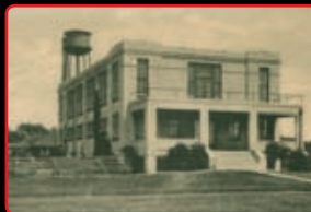
1910 Coeducation ends.