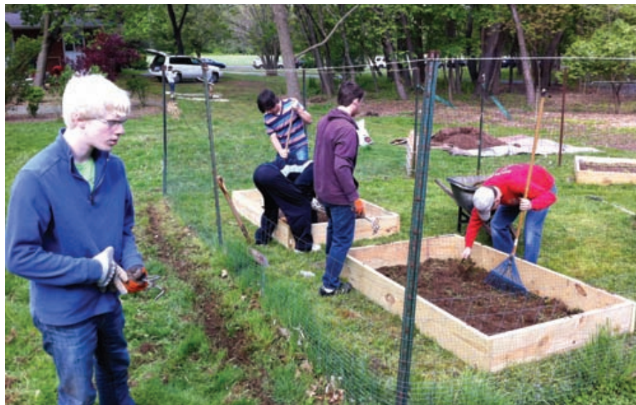
Students getting ready to plant and maintain the gardens

in the same containers for pickup. This simplifies our operations, and has allowed some simple but innovative solutions that divert recyclable materials from landfills. Working with the cleaning staff and the Operations Department, we have also initiated outdoor recycling for the first time at Pennington. Being able to implement this so quickly speaks to the nimble working environment and close community here at Pennington. We worked together to identify current placement of outdoor trash cans, realized that many were redundant, and thus paired them up, with one for landfill trash and one for mixed